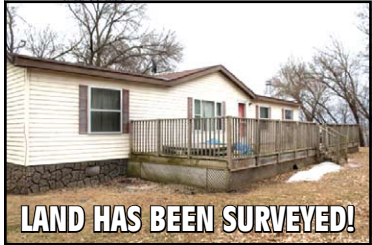
LAND HAS BEEN SURVEYED!

±167.49 ACRES LOCATED IN SECTION 9, EAST LAKE LILLIAN TOWNSHIP, T-117-N, R-33-W, KANDIYOHI CO.