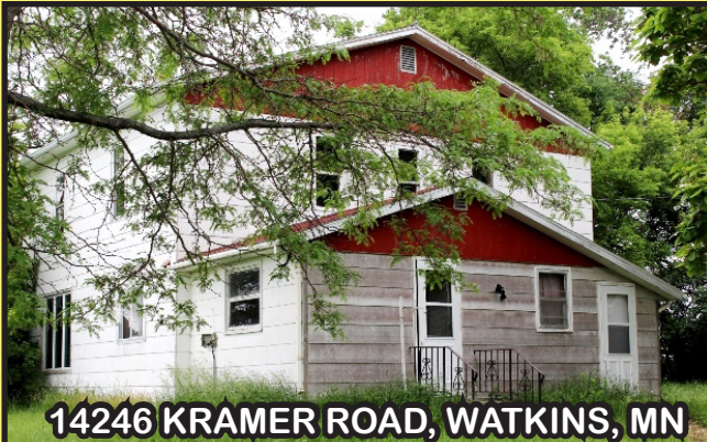
14246 KRAMER ROAD, WATKINS, MN

WED., SEPT. 5, 2018 • 5:30 P.M. • Eden Valley/Watkins, MN 7.5 +/- Acres, Section 33, Luxemburg Twp., Twp. 122, Range 30