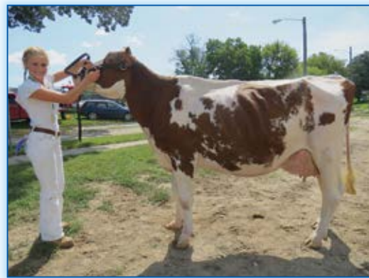
Lot #380. Ruby by Redburst, 4-H Grand Champion 2017 Kandiyohi County Fair, She is a Sister to the 88 Pt. Deuce. She sells Fresh Feb. 2017 and Milking 105 lbs. per Day, She has Two Red & White Daughters Selling