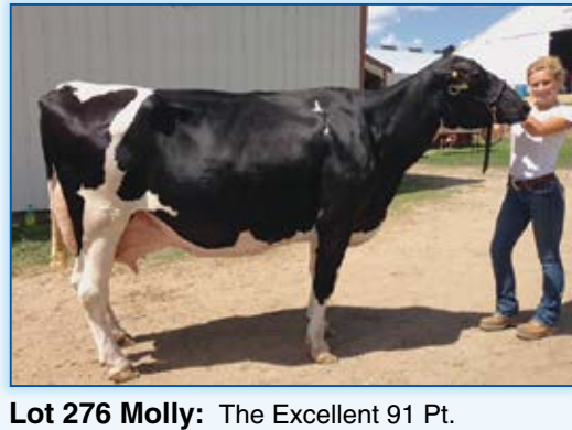
Lot 276 Molly: The Excellent 91 Pt. Alexander, 4-06. 305D, 30,326 Milk, 3.6 1100 Fat, 3.1 944 Protein, Her Daughter by Headliner Sells

Lot 283: 88 Pt. Red & White SS Deuce with Several Daughters and Granddaughters Selling