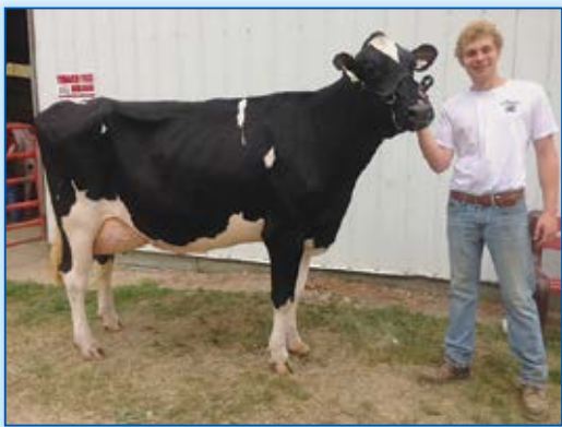
Lot 242: Excellent 90 Pt. Denison, 5.0 Yr. 32,817 M, 817 F, 809 P. She has produced an Excellent Palermo Daughter, Her 81 Pt. 2 Yr. Old Granddaughter by Explode Sells Due by Sale Date.