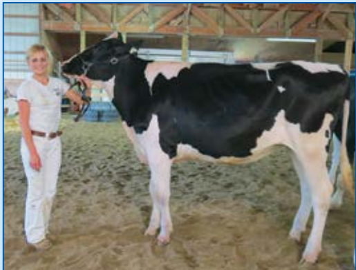
Lot 443 Arrow: A GW Atwood Springing 2-Yr. Old, due Christmas time